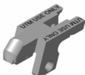
Fig 3 UTM GLOCK 19 Locking Block