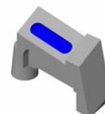
Fig 4 UTM GLOCK Extractor